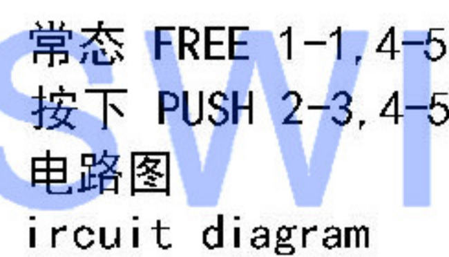
常态 FREE 1-1, 4-5 按下 PUSH 2-3, 4-5 电路图 ircuit diagram